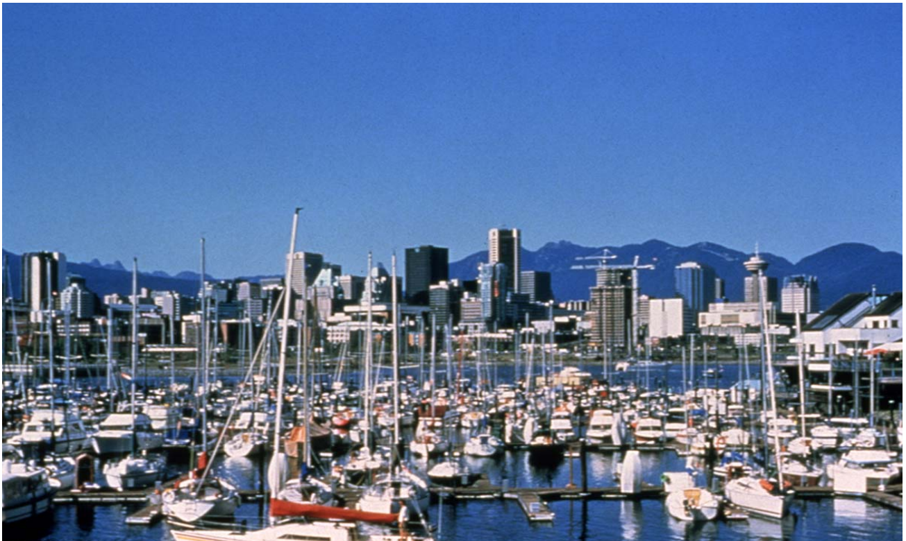
False Creek Boats